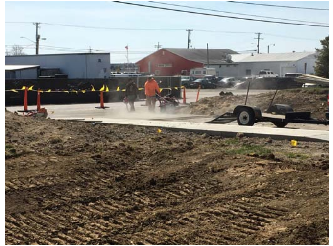
Views of driveway installation.