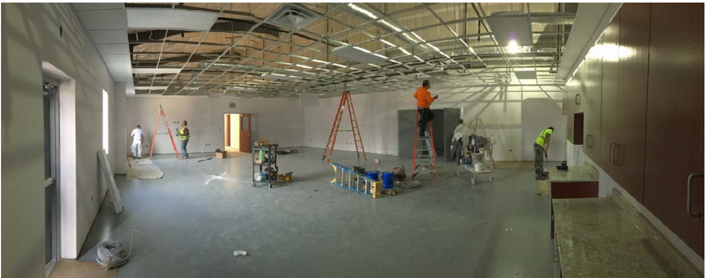
View of crew room. Ceiling grid have been installed. Interior painting ongoing. Epoxy flooring have been installed. Wiring for lighting is being installed.