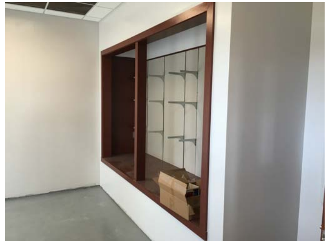
Views of completed display case installation completed