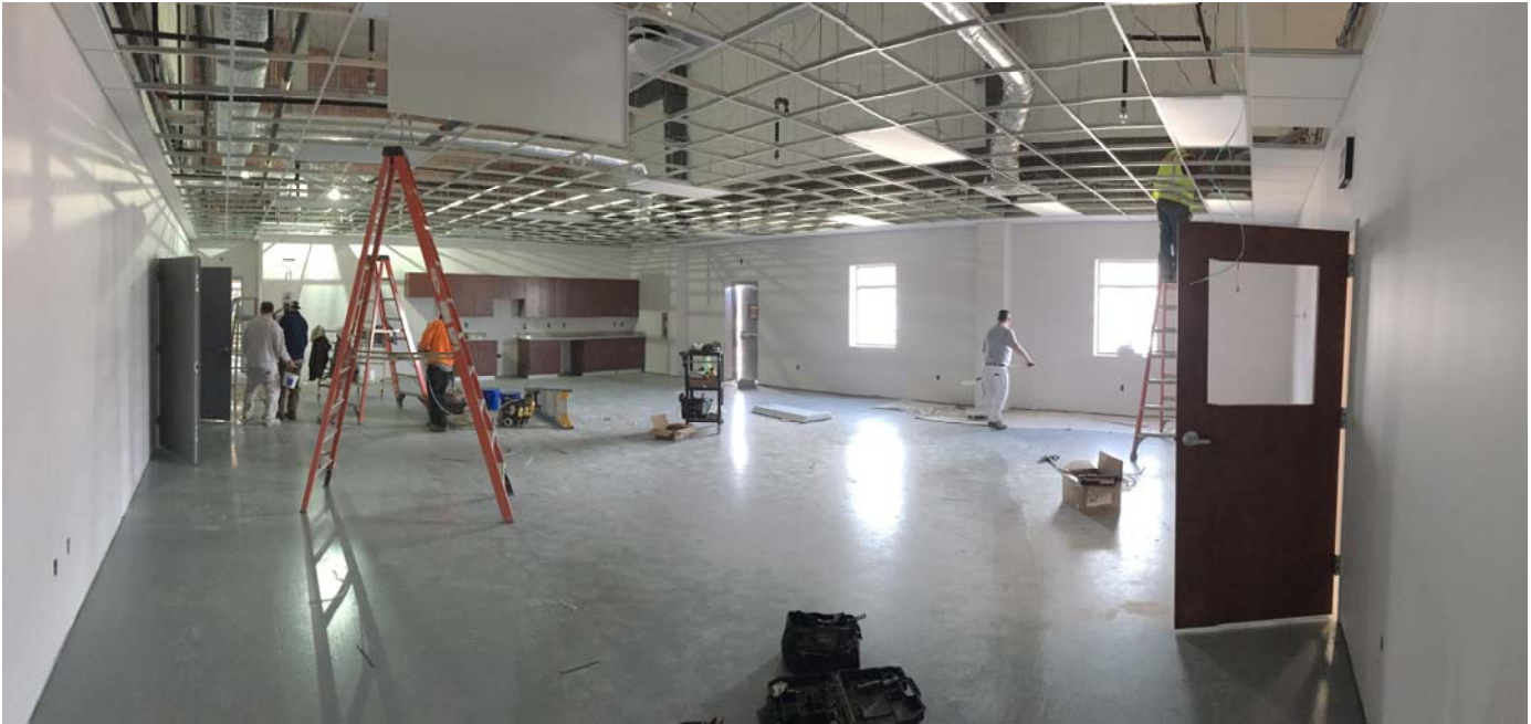
Another view of the crew room.