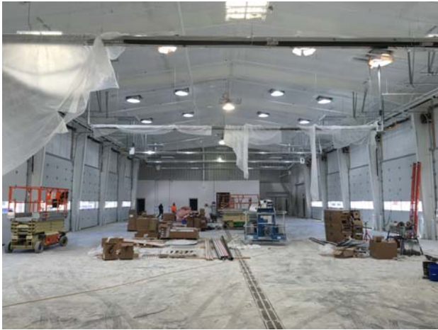
Views of the garage with the solartubes installed. Radiant heaters have been installed. Interior painting have been completed. All utility lines have been installed.