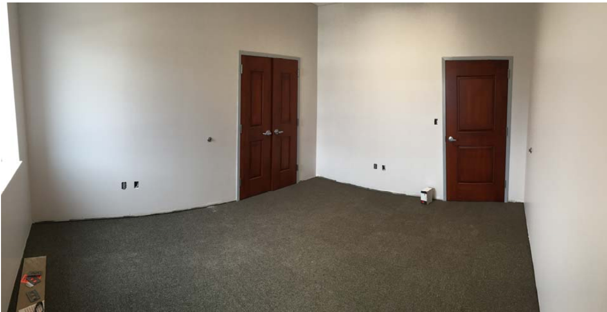
Office doors have been installed. Carpeting installed and walls painted. HM frames still needs to be painted.