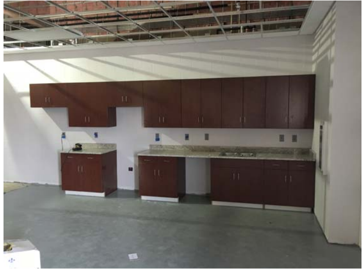
View of cabinetry in crew room