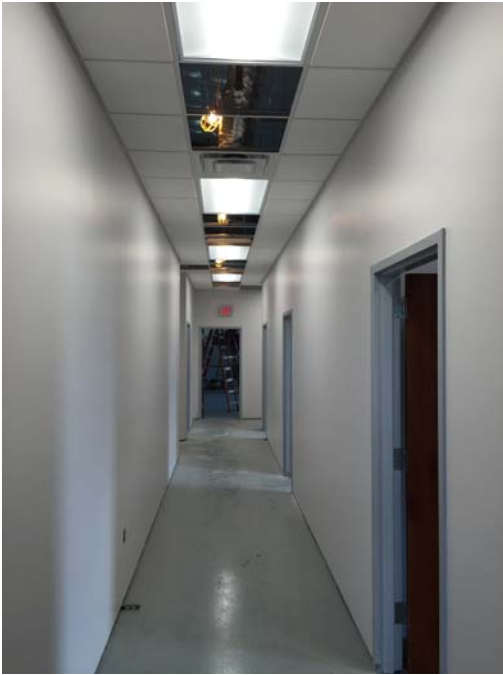
View down main corridor.