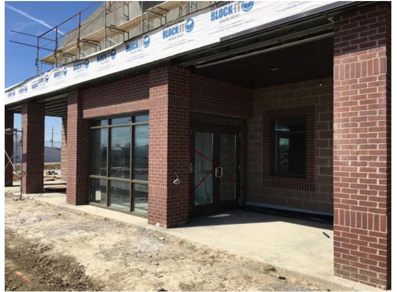
Brick columns and canopy with metal soffit panels. Storefront entry installed at vestibule and in lobby.