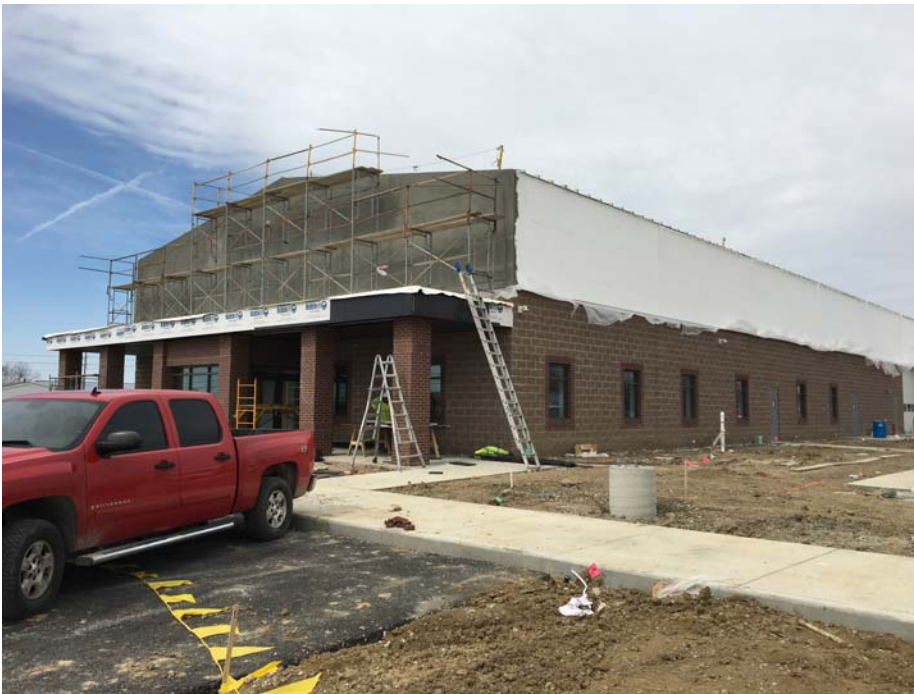
SE corner of building.