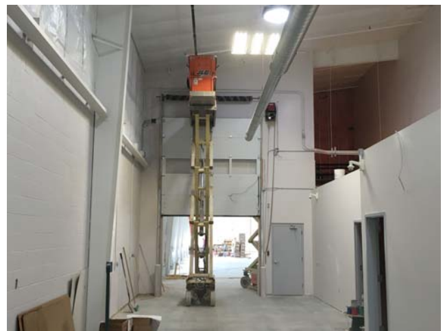
Views of meter department / storeroom. Interior painting completed. Gas and plumbing lines haven been installed.