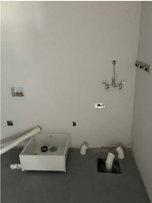
View of laundry room with mop sink roughed-in