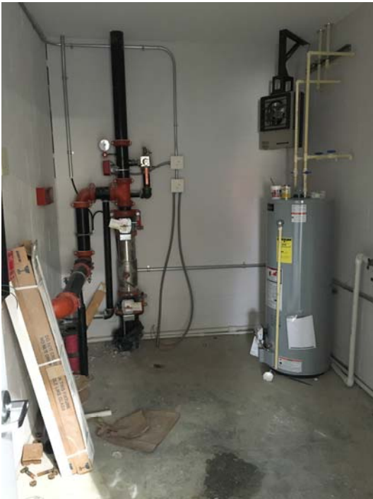
View of sprinkler riser room.